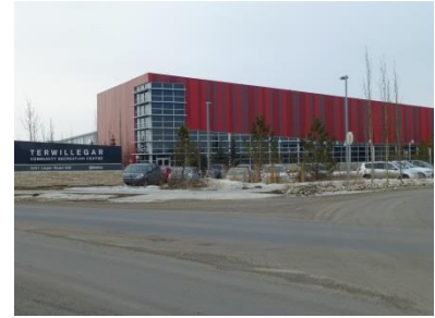
Recreational Centre: Electrical Power, Lighting, Data, Phone, Alarms

The following is a list of building types that we have engineered: