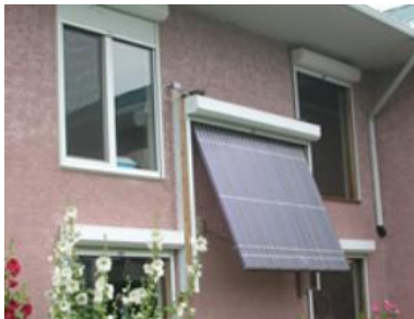
Residential and Commercial Solar Systems