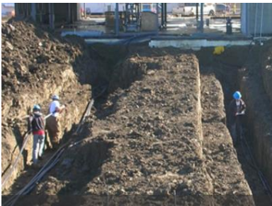
Residential and Commercial Geothermal