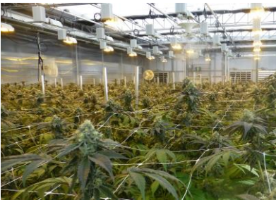
Cannabis Mechanical and Electrical Systems