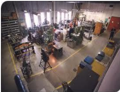
Welding Shop: HVAC – Indoor Air Quality

Our Building Services team works to increase the value of your building by designing solutions that incorporate innovative and energy-efficient technologies. Our solutions integrate mechanical, electrical, energy and other engineering services. Customers can access all their engineering needs from a single point of contact. Our integrated services reduce design time and overall project costs.