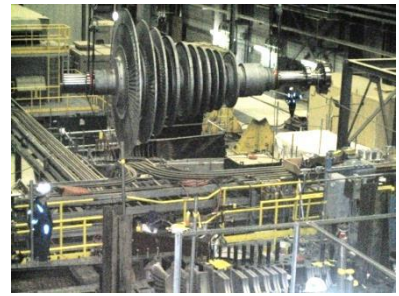
Steam Turbine & Generator Overhaul: Planning and Coordination