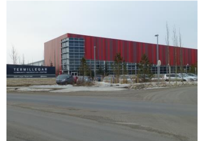
Recreational Centre: Electrical Power, Lighting, Data, Phone, Alarms

The following is a list of building types that we have engineered: