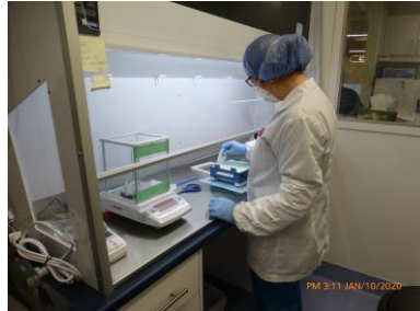
Pharmacy Compounding Systems