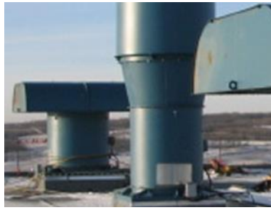
Commercial and Industrial HVAC